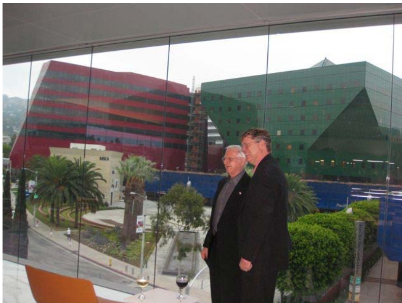
Pacific Design Center is across the street from the Library