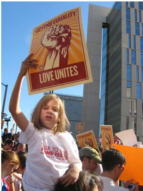
Girl holding Shepard Fairey Love Unites poster at a post-Prop 8 rally downtown LA

Murals by Fairey, Retna (a.k.a. Marquis Lewis), and Kenny Scharf on the exterior walls of the library are part of a collaboration between Vanity Fair and Cadillac in partnership with the City of West Hollywood and the Museum of Contemporary Art (MOCA) as part of their popular "Art in the Streets" exhibition (now at The Geffen Contemporary at MOCA until August 8). Renowned photographer David LaChapelle is shooting the artists and their murals for a spread in the November issue of Vanity Fair , which goes on sale Oct. 11. The official unveiling of the murals is slated for October 12.