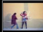
Pacific Standard Time:35 Years Of