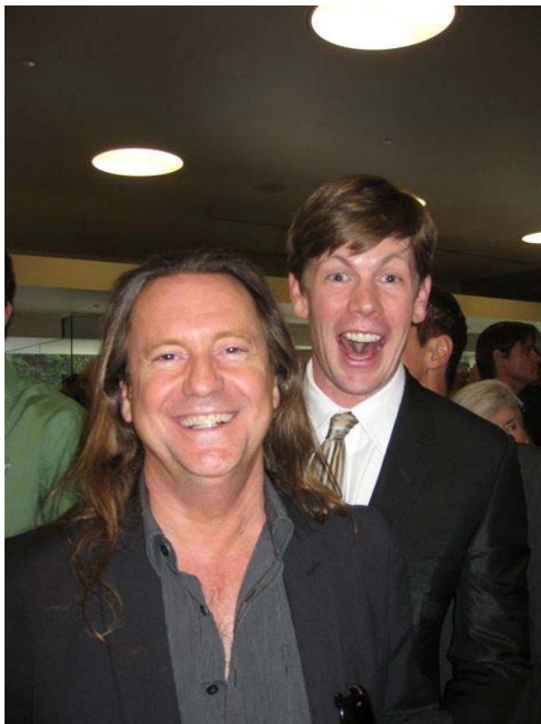
Eric Shaw Quinn and Christopher Rice