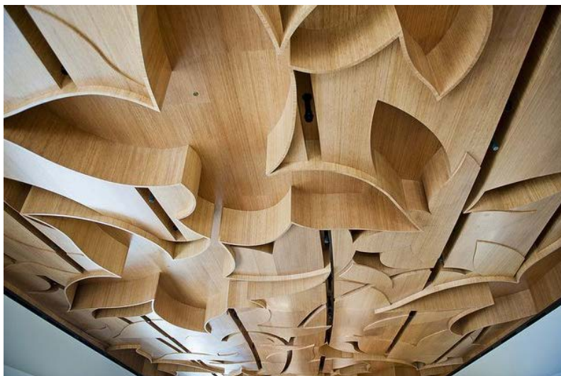
Detail from ceiling in West Hollywood Library

The new Library complex has a creative feel to it, with art inside and out.