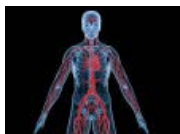
Science In Conrad Murray Trial: The Prosecution...