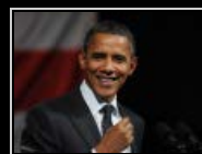
Avoid The Traffic With Our Guide To Obama's LA...