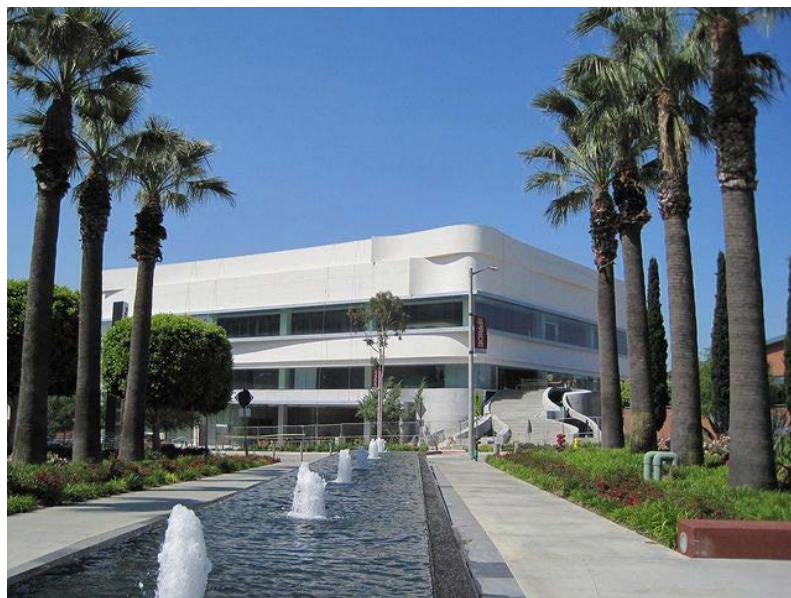
West Hollywood Library

Los Angeles is also proud of its library and public arts displays . But this new library, alongside the park and new sports facilities, has the potential to be what the Oscar Wilde Bookstore in Greenwich Village and A Different Light Bookstore at Sunset Junction in Silverlake -- the site of which was leveled on Saturday -- were for LGBTs and creative people in the 60s and 70s. Only this one is not subject to the winds of the economy and commerce.