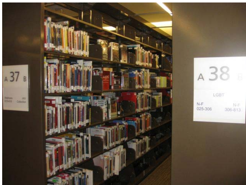
HIV and LGBT stacks in the Library

Los Angeles is also proud of its library and public arts displays . But this new library, alongside the park and new sports facilities, has the potential to be what the Oscar Wilde Bookstore in Greenwich Village and A Different Light Bookstore at Sunset Junction in Silverlake -- the site of which was leveled on Saturday -- were for LGBTs and creative people in the 60s and 70s. Only this one is not subject to the winds of the economy and commerce.