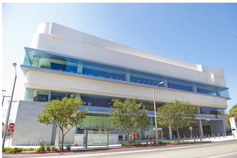
West Hollywood Library

I am a child of what conservatives in the dark and conformist 1950s called the Countercultural movement . Born of the outlaw and Beatnik Howl against societal oppression, the 1960s flourished with color and celebration of individual creativity and artistic expression. One of the leading lights articulating the significance of art and literature to civilization was President John F. Kennedy.