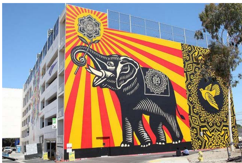
Shepard Fairey exterior mural part of MOCA exhibit