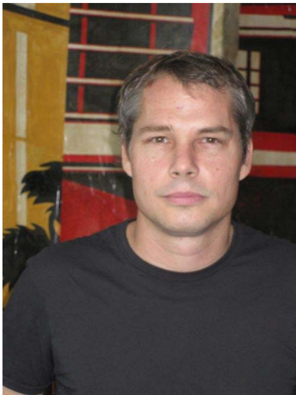
Artist Shepard Fairey