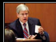
Final Witness Against Murray To Testify Today