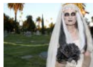
Los Angeles' Dia De Los Muertos Celebration...