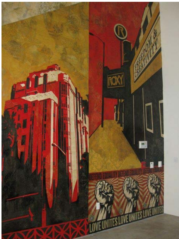
Fairey mural outside West Hollywood City Council Chambers