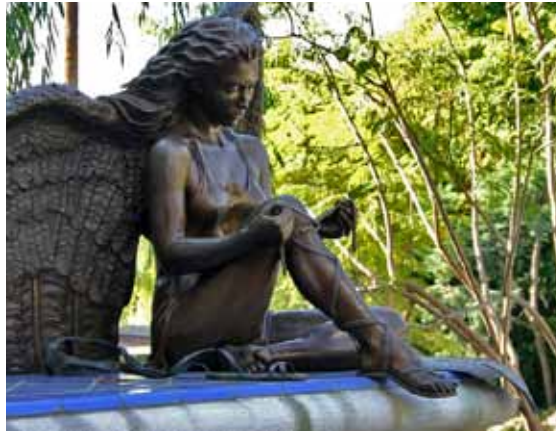
Works of art created under the Urban Art program can be found citywide.