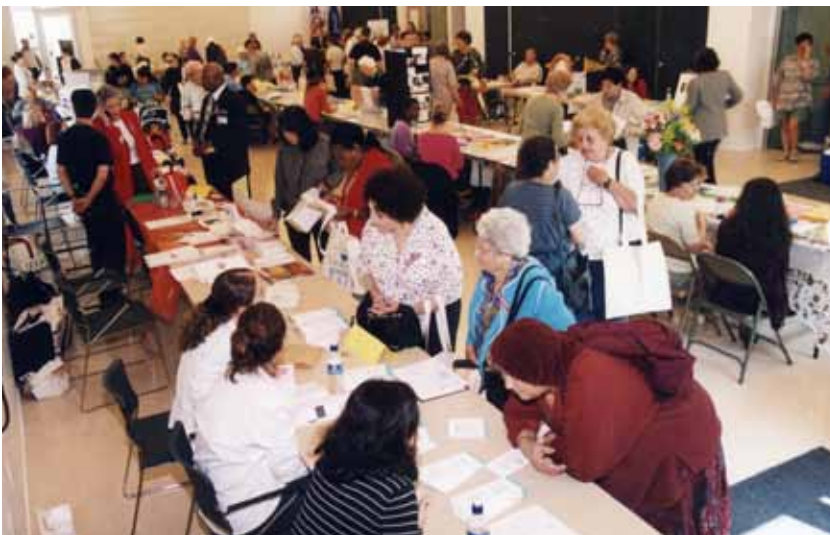
The City sponsors an annual Senior Health Fair.

State of California law does not require that a city's general plan address social services, arts and culture, or schools and education. These topics are addressed in this chapter because they promote West Hollywood's health, safety and welfare, and because they reflect the City's core mission to support and serve its diverse population. West Hollywood was one of the first cities in California to incorporate a human services element into its General Plan in 1988.