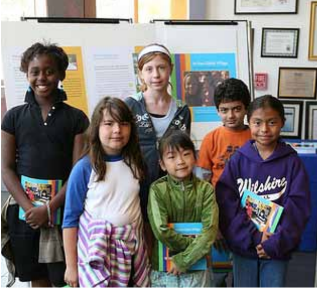
Local elementary school students contributed to In Our Global Village, a book documenting West Hollywood through the eyes of its youth.

assistance, food and nutrition programs, outreach and housing services for people who are homeless, employment services, substance abuse services, assistance to families, and counseling and recreation services for children and youth. The City also sponsors social-services-related transportation programs.