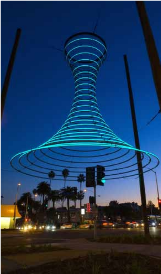
Artist Dan Corson's "Empyrean Passage" illuminates the night sky with contemporary neon art during its temporary display.

West Hollywood is a community known for arts and culture, with strong social networks, a rich sense of community, cross-cultural interaction, and diverse physical spaces for art of all kinds. The section below provides specific policies and a description of the existing context for arts and culture in the City.