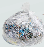
Bagged Shredded Paper, Flattened Cardboard, and Paper