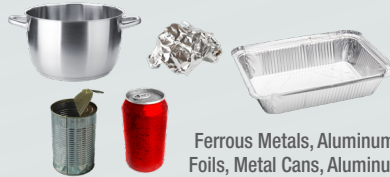
Ferrous Metals, Aluminum Cans, Foils, Metal Cans, Aluminum Pans