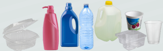
Plastic Bottles and Cups, Take-out Container, Round Dairy Tubs, Milk Jugs