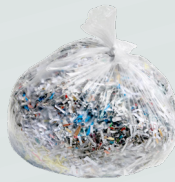
Bagged Shredded Paper, Flattened Cardboard, and Paper