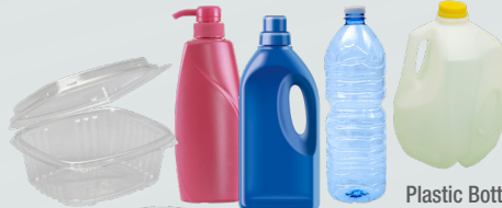
Plastic Bottles and Cups, Take-out Container, Round Dairy Tub, Milk Jugs