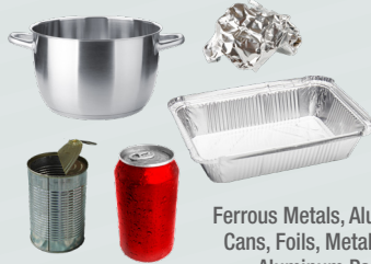
Ferrous Metals, Aluminum Cans, Foils, Metal Cans, Aluminum Pans