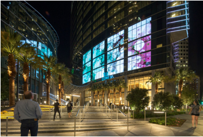
Precedent Images of Creative Integrated Digital Advertising

While it is not anticipated that any changes to published information will occur, the City of West Hollywood does reserve the right to update any information on the project webpage as necessary to resolve any unanticipated issues that may arise prior to, during, or after the screening period. Any updated information will be noted as updated. All applicants are encouraged to check the City's webpage before submitting their final application materials.