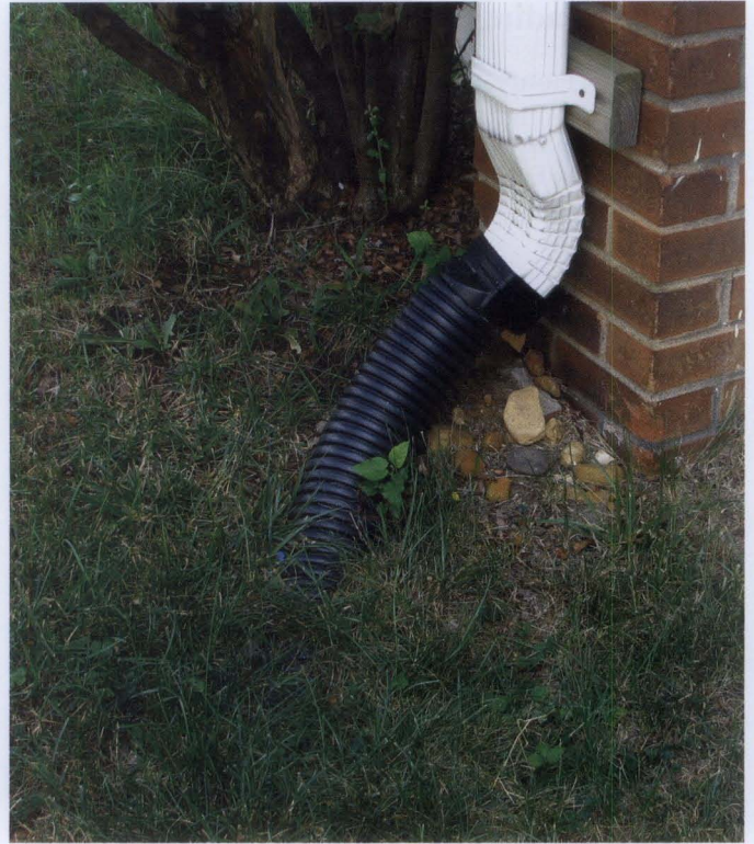
Figure 17. Extending downspouts at their base is one of the basic steps to reduce dampness in basements, crawl spaces and around foundations. Extensions should be buried, if possible, for aesthetics, ease of lawn care, and to avoid creating a tripping hazard.

Historic house journals, maintenance guides for older buildings, preservation consultants, and preservation maintenance firms can assist with writing appropriate procedures for specific properties. Priorities should be established for intervening when unexpected damage occurs such as from broken water pipes or high winds.