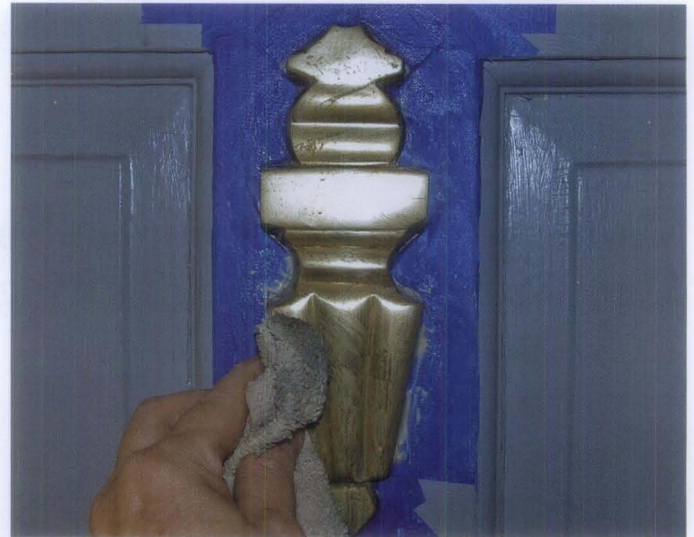
Figure 1. Maintenance involves selecting the proper treatment and protecting adjacent surfaces. Using painter's tape to mask around a brass doorknocker protects the painted door surface from damage when polishing with chemical compounds. On the other hand, hardware with a patinated finish was not intended to be polished and should simply be cleaned with a damp cloth.