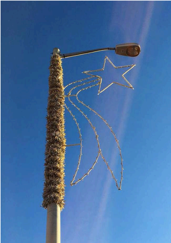
Pole Mount Design