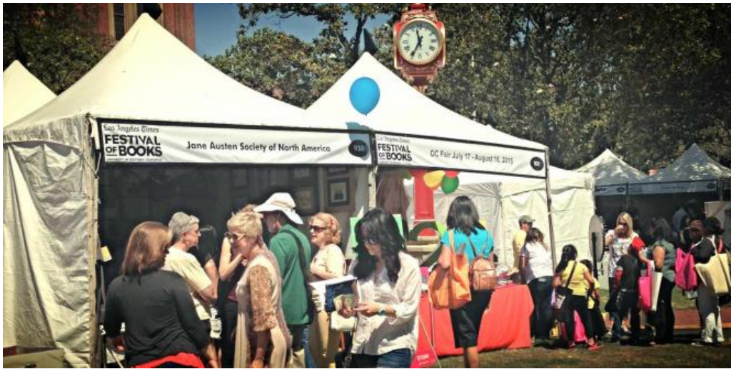
Los Angeles Times Festival of Books