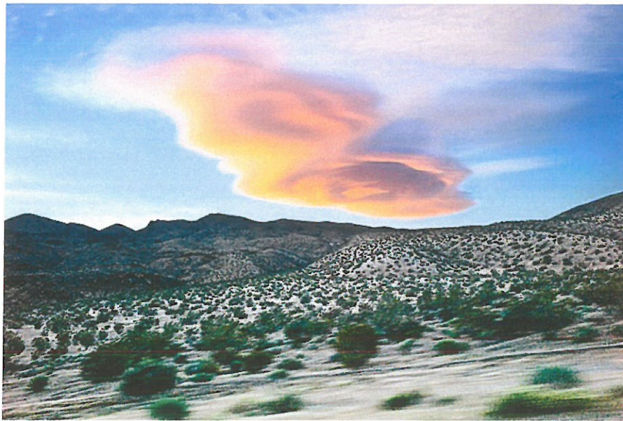
Osceola Refetoff's The Cloud that Followed Me Home. Out There at Gallery 825.