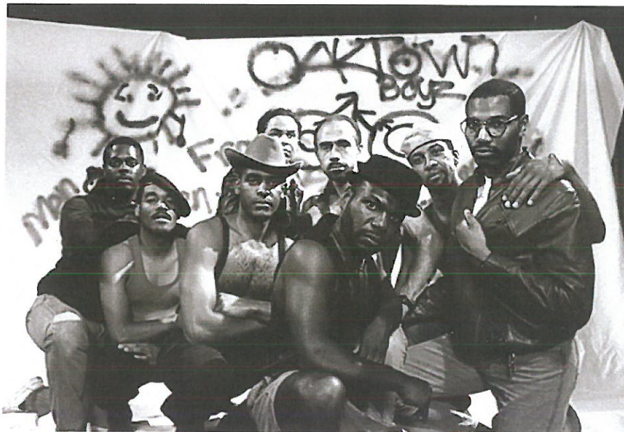
Still from Marlon Riggs' "Tongues Untied." At the Museum of Contemporary Art at the Pacific Design Center

Continuing the tradition of cosmic coincidence that is the Free Art Party Blog curatorial M.O., for about a fortnight between June 5th and June 14th, the Los Angeles art world zeitgeist focuses on illuminating the brave alternative voices that have historically flourished here in SoCal, and who these days are bolder and brighter than ever. A new gallery exhibition explores the private studio work of the city's splashiest public art muralists, and a pioneering punk rock icon explores her subversive visual side. A whole cluster of free arts programming lights up West Hollywood from the PDC to the galleries of La Cienega and La Brea and beyond – all in celebration of the Pride Month, LGBTQ Arts Festival and WeHo@30: Art AIDS WeHo juggernaut of history and fabulosity.