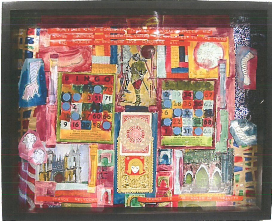
Exene Cervenka's Orange at Sloan Projects, Bergamot Station