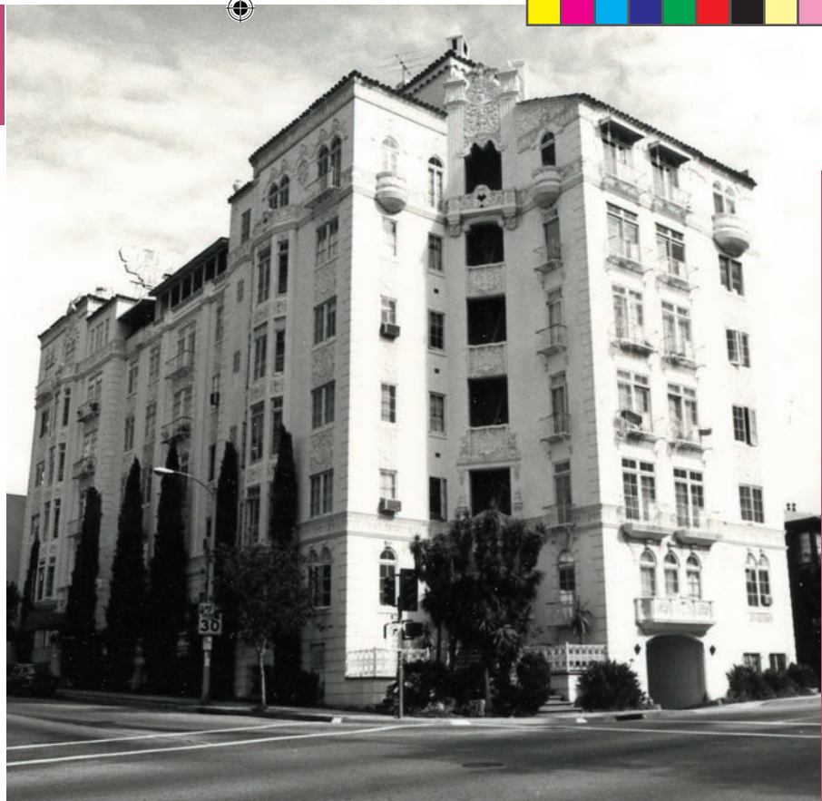
El Mirador, located at 1302-10 Sweetzer Avenue was built in 1929, and is a designated Cultural Resource.

For more than a year, the City of West Hollywood in