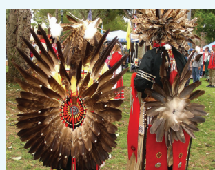
American traditional drum groups, dancing and food along with STI testing and resources. Free admission, www.apla.org

10:00 AM – 6:00 PM APLA Red Circle Project Pow Wow The fifth annual 'Celebrating All Life & Creation' Pow Wow promotes HIV awareness and prevention among the Native communities and features Native