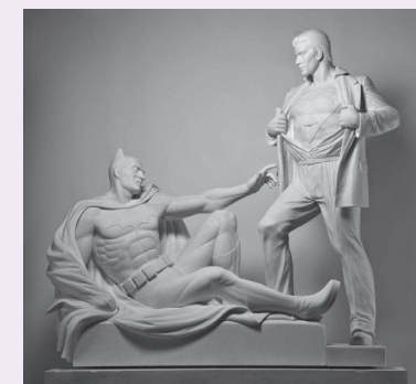
Mauro Perucchetti's Modern Heroes will be on display the entire summer on San Vicente Boulevard in West Hollywood Park.