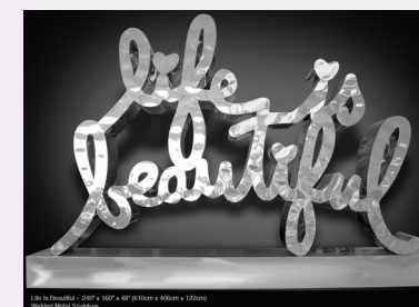
Mr. Brainwash's 'Life is Beautiful' stands about 20 feet tall and joyfully connects with this year's theme of One City One Pride 'WeHo@30, Life@30'.

These 'One City One Pride Art Ops' will be on display at LA Pride Festival Grounds.