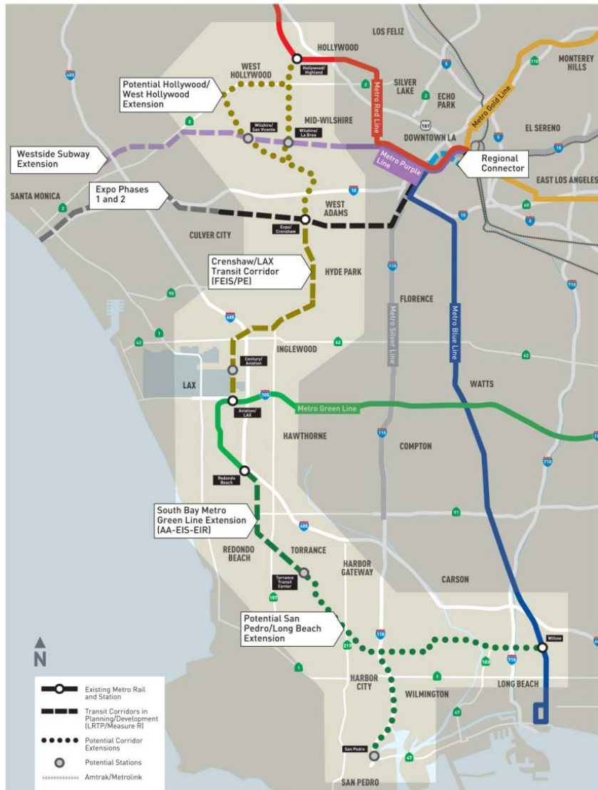
Potential West Hollywood to San Pedro/Long Beach Transit Corridor

Receive and File Report on Issues, Alignment Options and Costs to Conduct an Initial Review