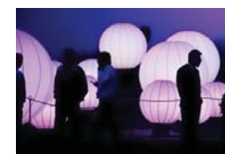
Examples of temporary and permanent public art that could define a gateway or gathering place within the Avenues, and could include artist-designed lighting.