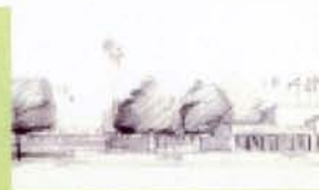
Fiesta Hall Autocourt