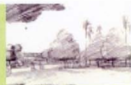
The Great Lawn

Modifications to the adopted master plan include the removal of on street parking along Vista Street, the expansion of the central lawn with a priority for grass and trees; the inclusion of recreational/ornamental water feature on the site of Great Hall/Long Hall, the reversal of the basketball court and tennis center pavilion; the refinishing of the ground plane of the south parking lot; the creation of a site for new childrens/ tiny tot facilities; and the the appropriation of three commercial properties along Santa Monica Boulevard for both park expansion and new community facilities .